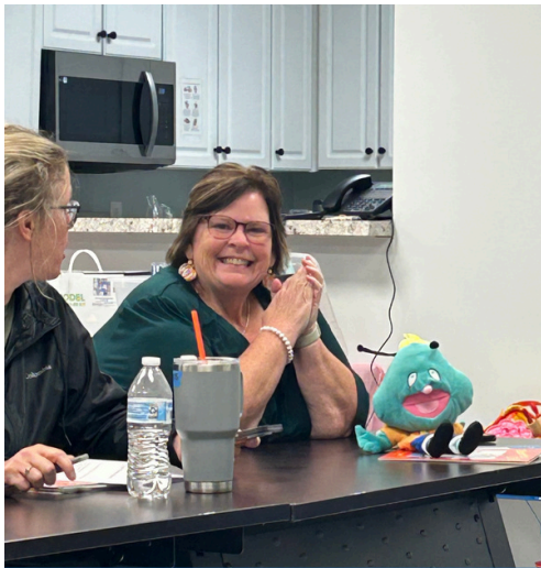
Equipping early educators through trainings and technical assistance