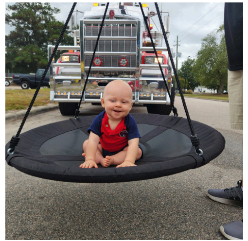
Bringing the smiles to Touch-a-Truck Beaufort County