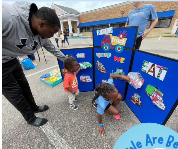
Collaborating with partners to engage and strengthen families