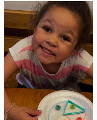
Learning through play during Week of the Young Child