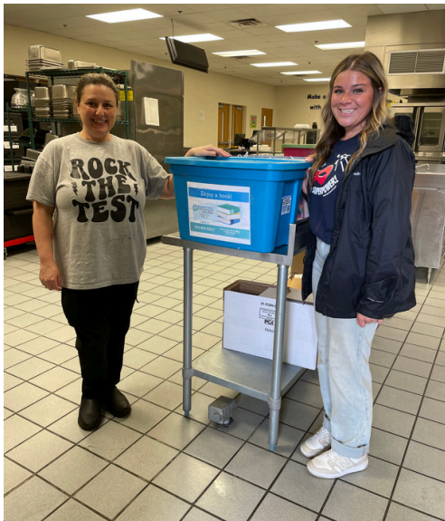
Distributing gently-used books at summer feeding programs