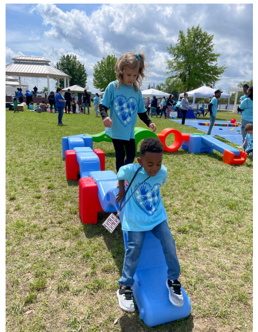
Making new friends at the "Paint the Town Blue Parade and Festival"