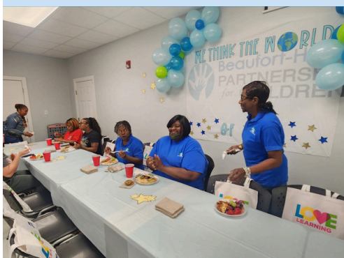
Supporting our early educators during Teacher Appreciation Week