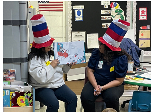
Reading aloud during Read Across America Day