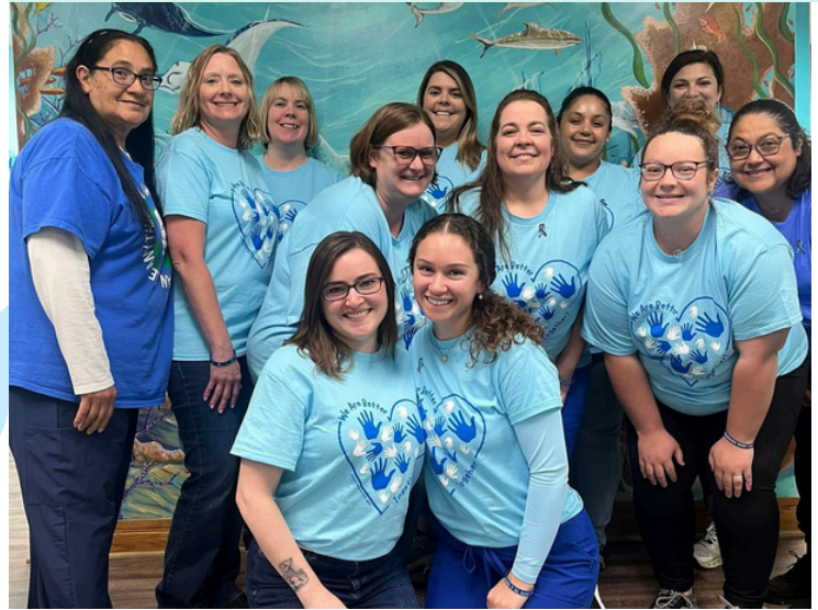
Standing together during Child Abuse Prevention Month with community partners