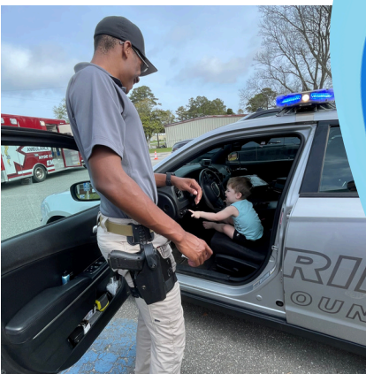
Meeting new friends at Touch-a-Truck Hyde County