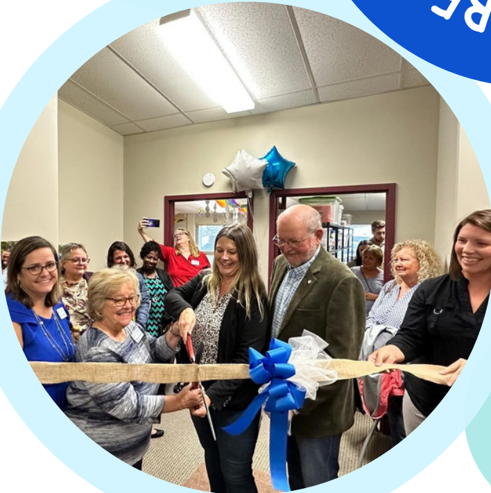
Ribbon cutting at the Hyde Resource Center